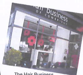
The Hair Business