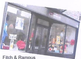
Fitch & Ramous