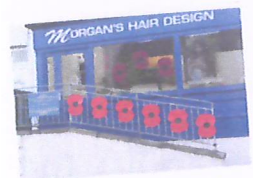
Morgan's Hair Design